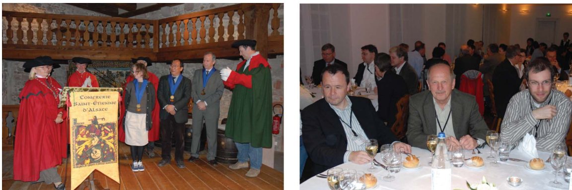
Figure 3. The wine tasting and conference dinner were not the only social events which were enjoyed by the conference participants.

I believe all applicants enjoyed an excellent and very diverse scientific program covering almost all aspects of liquid crystal research from very fundamental studies to future potential applications of liquid crystals in device technologies, bioscience and biology as well as in medical applications. All conference participants were spoiled not only by the beauty of Colmar as the location, but also by the culinary delights served during each lunch break. In addition, conference participants and accompanying persons could enjoy one or both of the organised excursions: a guided tour through the historical centre of Colmar and a wine tasting trip to Eguisheim, a medieval village fortified in 1257 and the birthplace of Pope Saint Leo IX, in the heart of the Alsace wine region. As a final highlight of the conference, participants also experienced a fantastic banquet at the castle of Kientzheim, near Kaysersberg, which